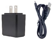
Fast charge adapter and CtoC data cable